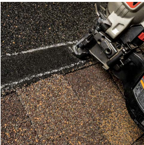
LayerLock™ Technology Powers the industry's widest nailing zone