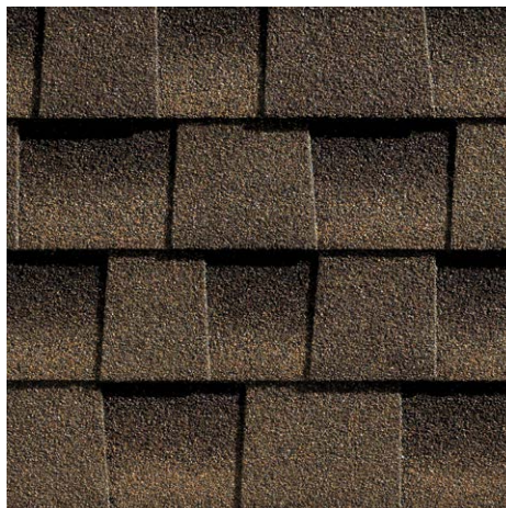
Beautiful finished look It's the same Timberline® Shingle you know and love, now even better