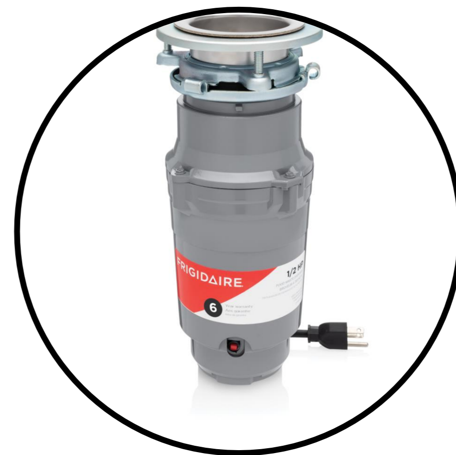
Grind Chamber Capacity