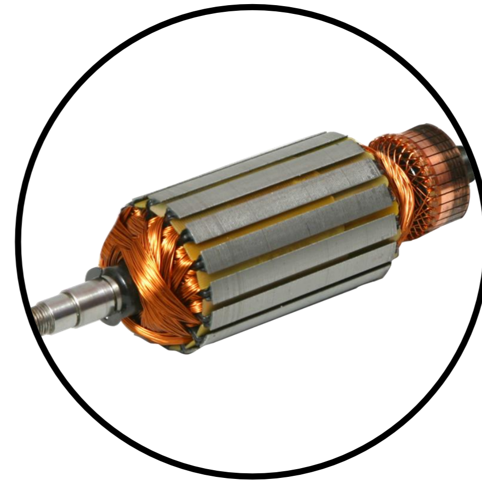
Permanent Magnet Motor