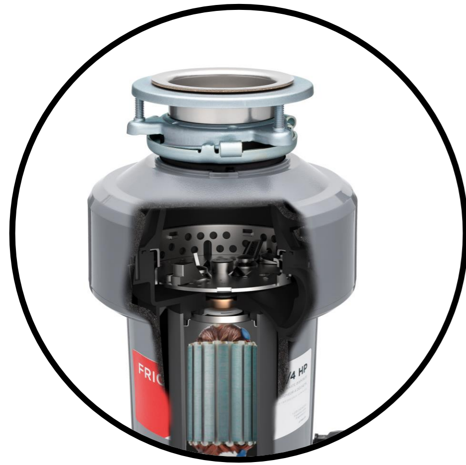
Torque Master® Grinding System