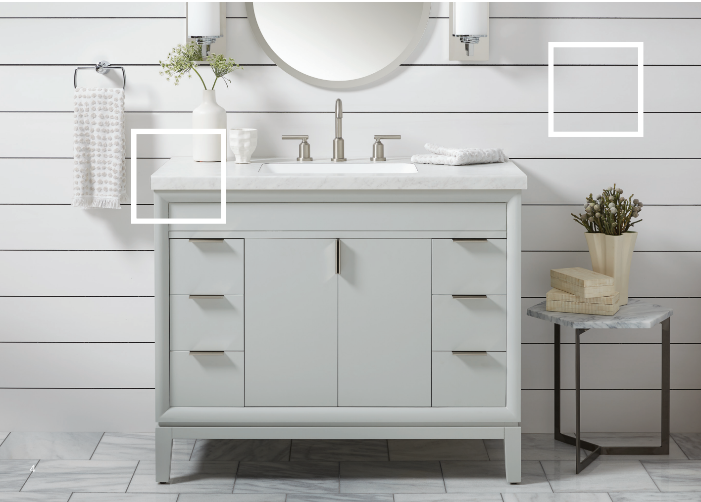
VANITY TOP | WHITE CARRARA 4924-38 SHIPLAP WALL | FROSTY WHITE 1573-60

Wilsonart® HPL creates spaces that radiate best-in-class design, performance, and simplicity. With the help of Wilsonart® Home, your spaces will be elevated to new levels of beautiful. Practical. Extraordinary. It's a transformation that will inspire spaces fit for your dreams, right in the comfort of your own home.