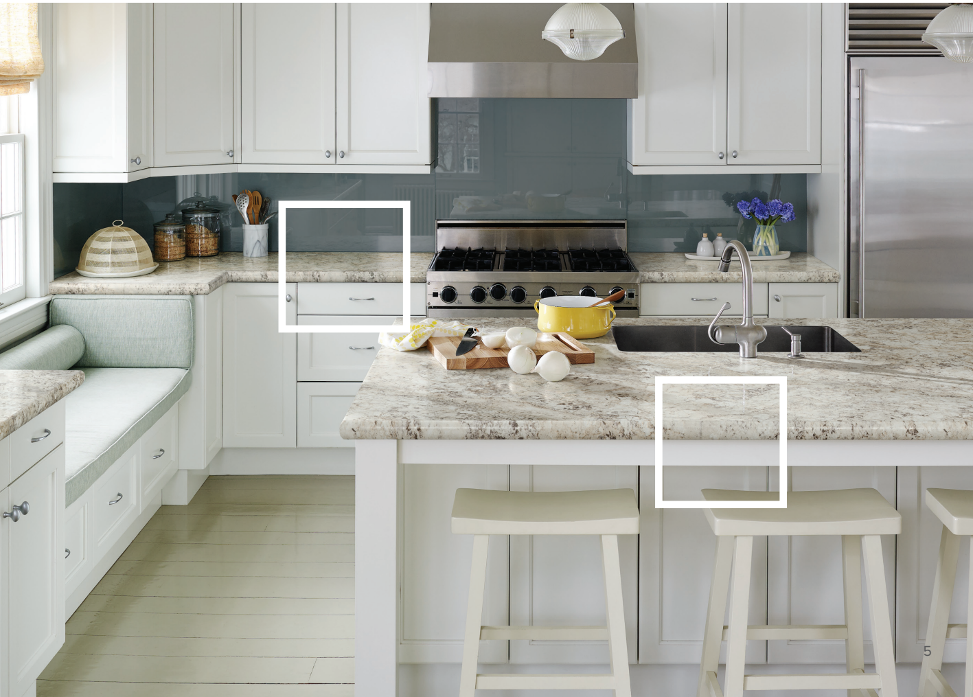
COUNTERTOP, CRESCENT EDGE | SPRING CARNIVAL 1876K-35

Incredible looks and performance at an affordable price.