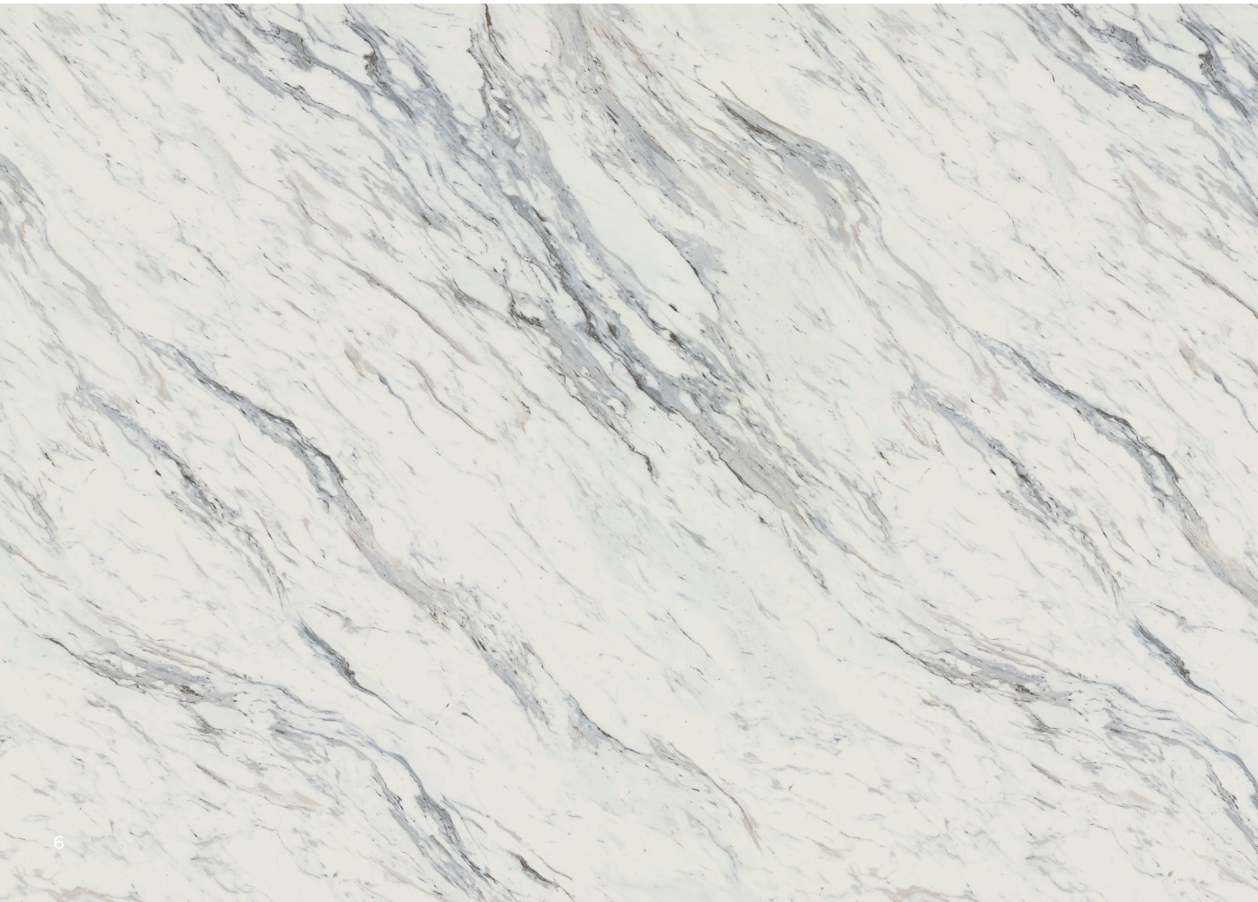
CALCUTTA MARBLE 4925K-07

“This is not your grandmother’s countertop”. Today’s HPL competes with some of the most sought after surfaces. Wilsonart® HPL combines beauty and performance to create a surface that withstands everyday cooking, spilling, eating, working, and playing. Wilsonart® HPL offers this durability in a wide variety of tones and textures, all of which can match your home’s aesthetic and transform kitchen countertops, island countertops, open shelving, vanity tops, and much more.