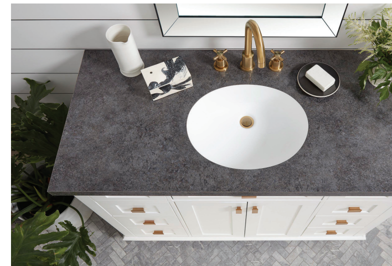
VANITY TOP | DEEPSTAR SLATE 1818K-35 SHIPLAP WALL | FROSTY WHITE 1573-60

Live and move in your space without worry. In addition to their high price points, traditional natural surfaces are porous and soft. Wilsonart® HPL eliminates these common threats with built in stain and scratch resistance that provides peace of mind and lasting beauty. And when life's usual mishaps do occur, Wilsonart® HPL is simple to clean and disinfect. It's consistently durable, easy to maintain, and always prepared for the unpredictable.